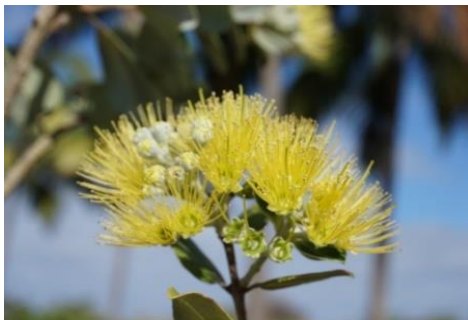
'Ohia Lehua Melemele