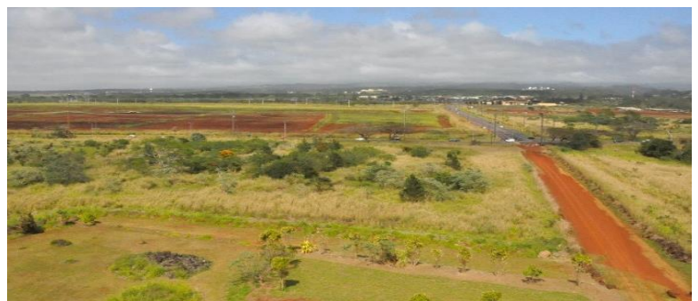
Aerial view of the easement road to Kūkaniloko.